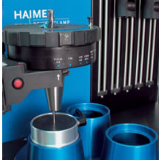
Unshrinking device for broken tools.