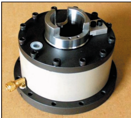
Hollow shaft cylinder