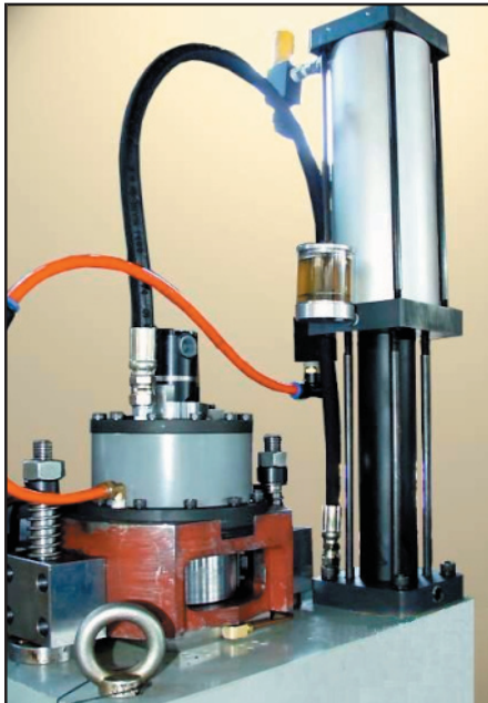
Air/oil booster combined with hollow unclamp cylinder, in use on a machine.